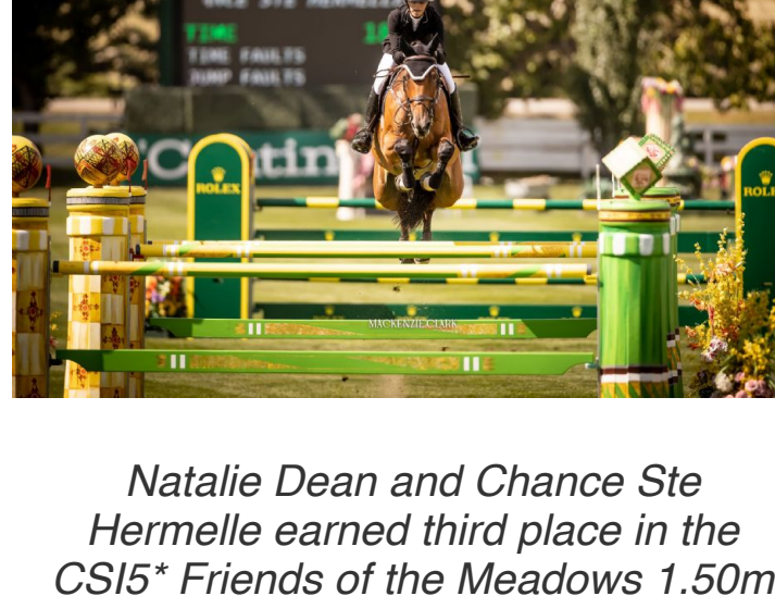
CSI5* Friends of the Meadows 1.50m at the Spruce Meadows 'Continental' tournament in Calgary, Canada.