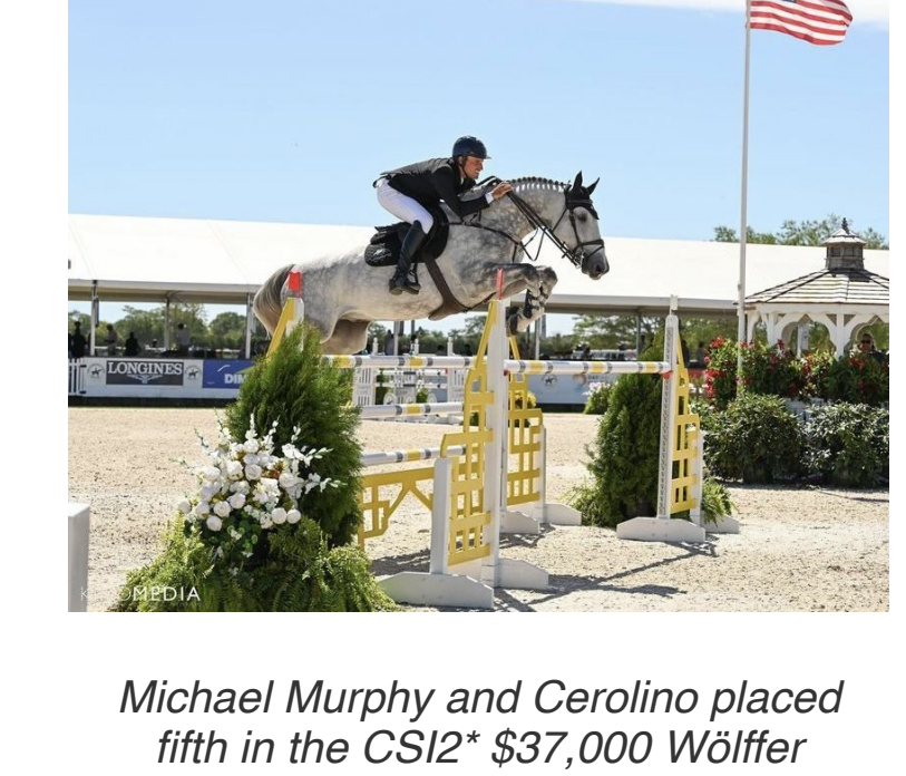
Estate Grand Prix Qualifier at the Hampton Classic Horse Show in Bridgehampton, NY. Photo by Kind Media