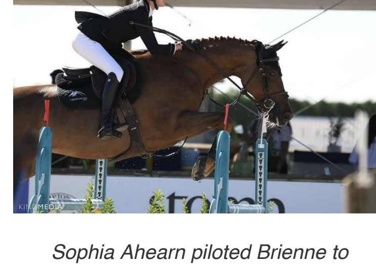
eighth place in the $12,500 Pacaso Medium Amateur Jumper Classic during the Hampton Classic Horse Show in Bridgehampton, NY.