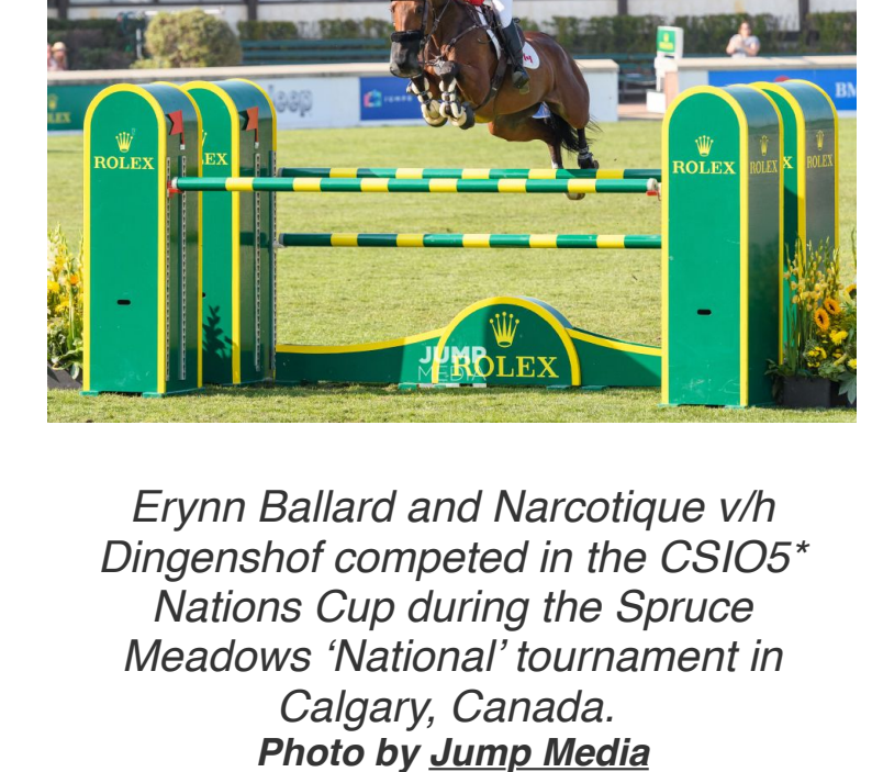
View More Results